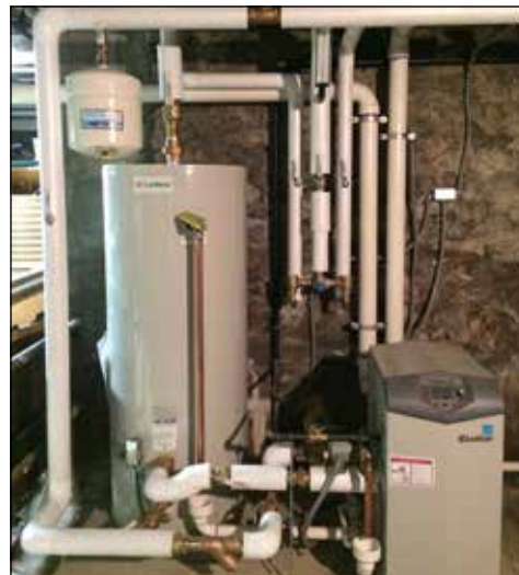
Hot water system, before and after.